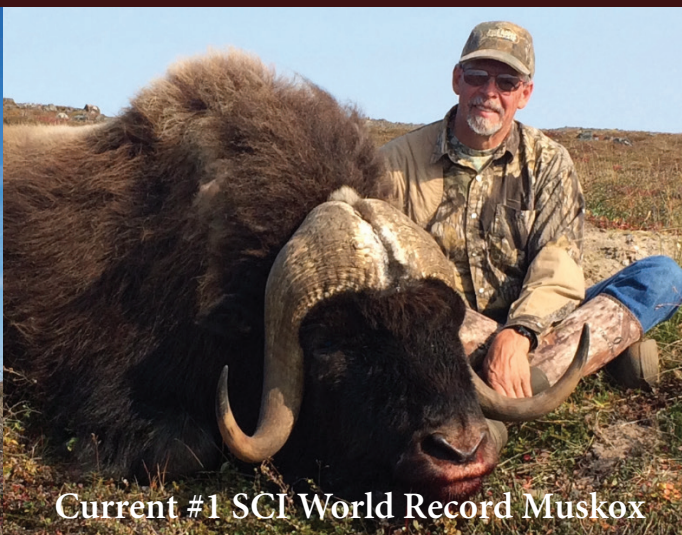
Current #1 SCI World Record Muskox